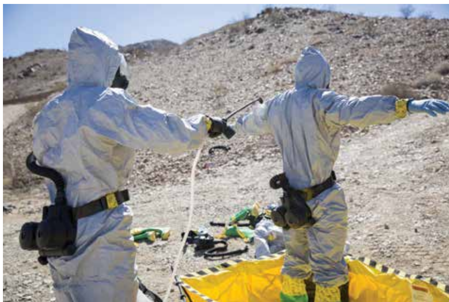
Explosive Ordnance Disposal and Engineer Support will be required to support maneuver especially in contaminated environments.