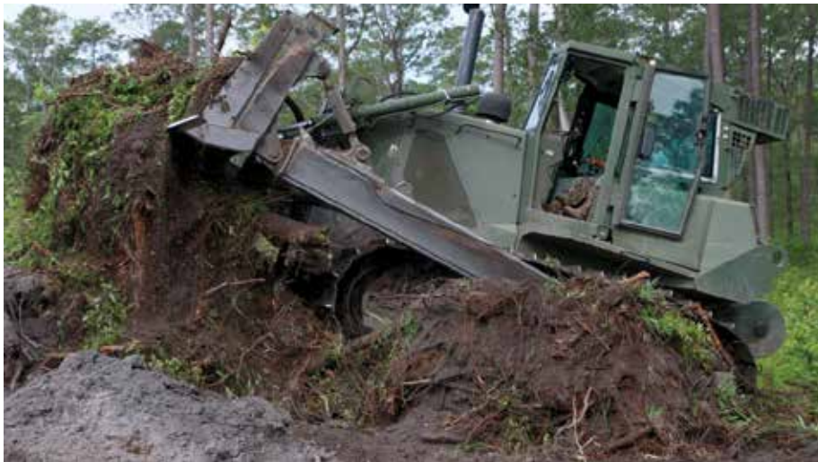
During combat operation, the LEEG can support tactical mobility for the Marine littoral regiment.

engineers with partners and allies. Additionally, LEEG engineers will be critical to the establishment of the limited military infrastructure required for the eventual creation of Expeditionary Advanced Bases.