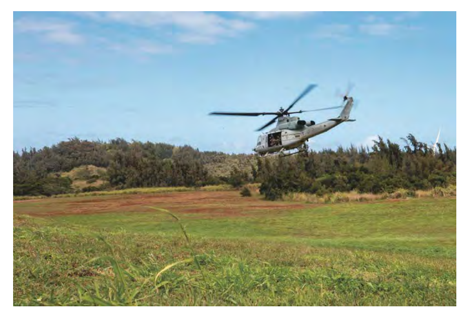
Deception planning will be important.