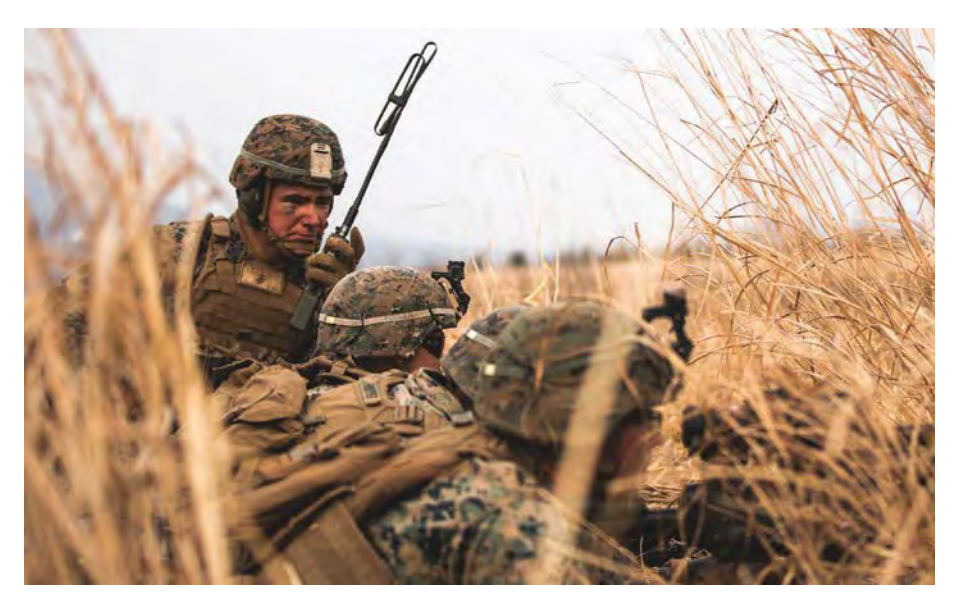
Marines learn by fighting.

the concepts and capabilities required to achieve a position of advantage in future wars. More importantly, they allow the military professional to see into possible futures and anticipate changes. By routinely fighting with new capabilities and testing different maneuver concepts, Marines hone their operational judgment.