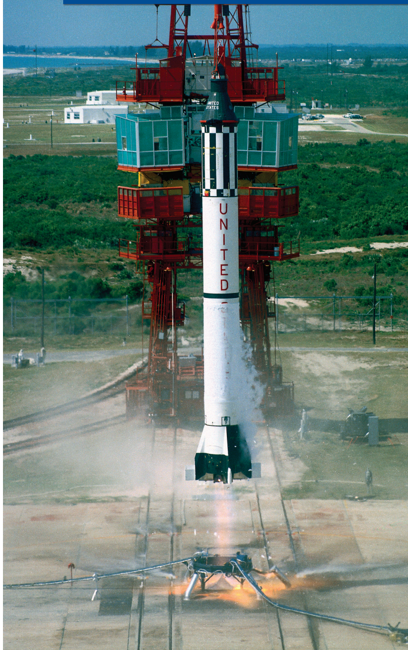
History in the making: CDR Alan Shepard's Freedom 7 spacecraft was perched atop a Redstone rocket and launched for a suborbital flight, May 5, 1961.