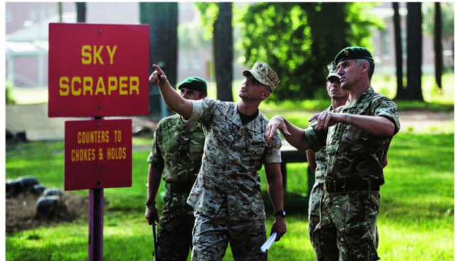
Royal Marine Col Kevin Oliver, Commandant of the Commando Training Centre Royal Marines, observes the Confidence Course at Marine Corps Recruit Depot Parris Island, S.C., July 9, 2015. Oliver visited Parris Island to discuss the role of women in combat with representatives from the Marine Corps Force Integration Office.