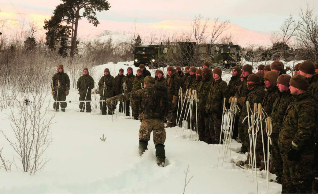
A British Royal Marine mountain leader explains to U.S. Marines with Black Sea Rotational Force how to set up their tents during cold weather training at Porsangmoen, Norway, Feb. 2, 2016. Cold weather training is an area of expertise for the Royal Marines, and the U.S. Marines often benefit from their instruction.

have served alongside or at least interacted with a Royal Marine at some point during their career, either operationally or thanks to one of the exchanges.