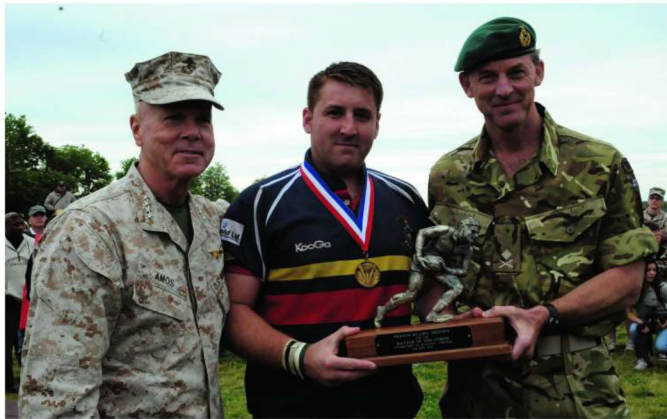
Above: Gen James F. Amos, 35th Commandant of the Marine Corps, left, and the Commandant General Royal Marines, MajGen Buster Howes, right, present a trophy to a British Royal Marine rugby participant following a rugby match between U.S. and Royal Marines at MCB Quantico, Va., April 28, 2012.

Particularly over the past 15 years, Royal Marines, who are the "amphibious arm" of the Royal Navy, have worked together closely with U.S. Marines during a multitude of campaigns and operations. As a result, the shared warfighting values between the two organizations have become even more evident than ever before,