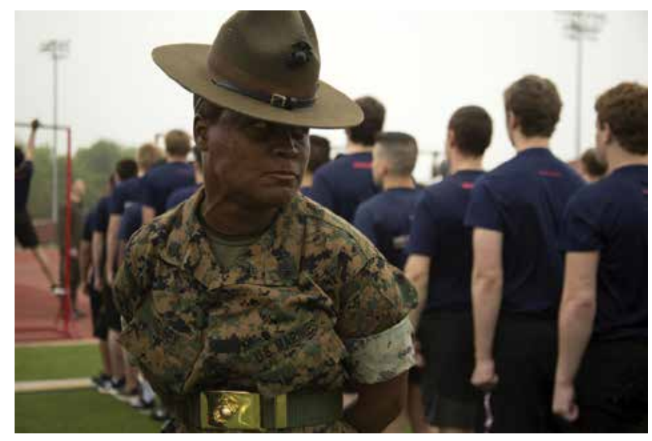
Poolees prepare to attend Recruit Training with the support of their recruiting Station and MCRD Drill Instructors.