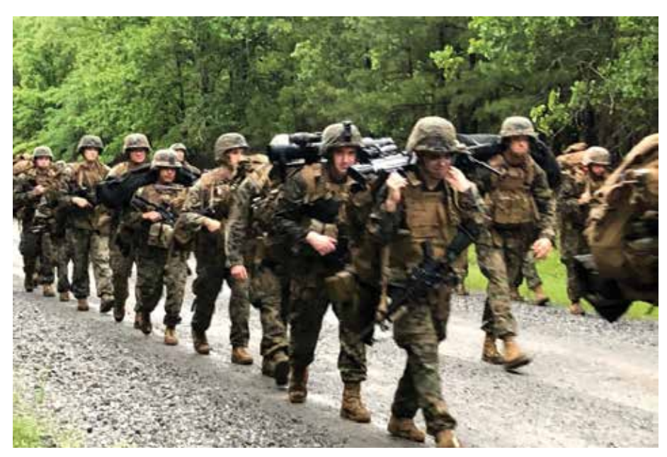
Over half of these Marines travel great distances to start their drill weekend with a forced march or other rigorous training.