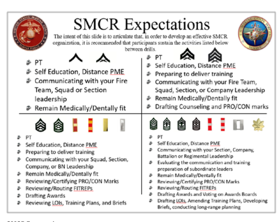
SMCR Expectations.

What is even more telling is that since 2011, the raw number averages eighteen–nineteen separations annually.<sup>3</sup> This means an entire rifle company of Marines has "gone UA" over the past decade. The question to ask is why? While the answer cannot be sufficiently answered in a single brief point, one contributing factor is that reserve Marines often have only a factual understanding of their commitment rather than an experiential understanding. Eventually, many conclude that their time is worth simply taking the other