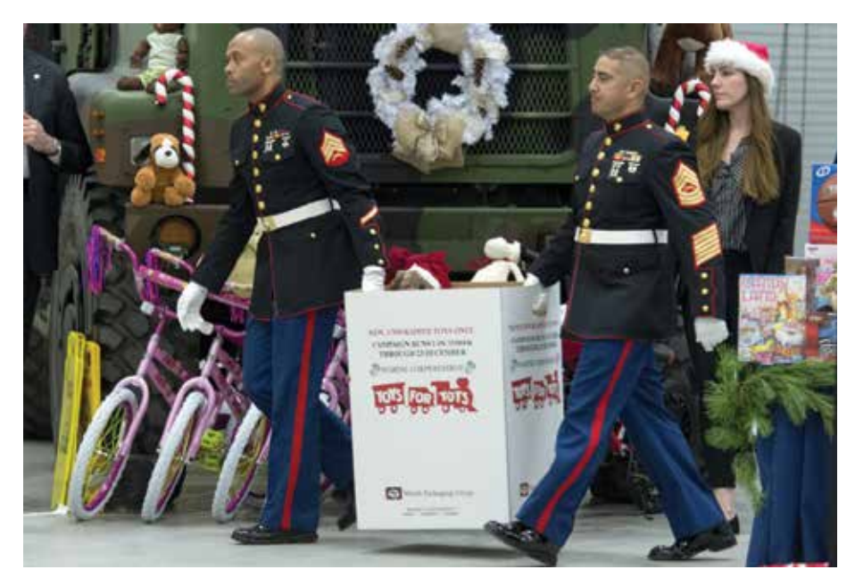
A fully capable reserve force can support both worldwide operational requirements and "at home" commitments like the annual Toys for Tots campaign.