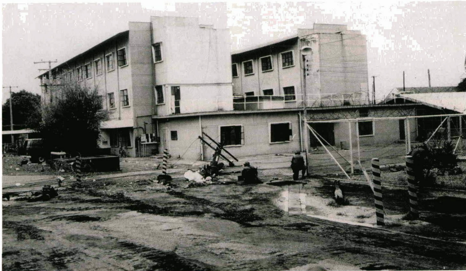
Battalion Landing Team 2/4 leathernecks guard the perimeter of the DAO compound at the beginning of Operation Frequent Wind.

The large Sea Stallion helicopters arrived at the DAO compound around 1400, and the Marines rapidly established security positions. The Americans and Vietnamese waiting at the compound under enemy fire were relieved to see the helicopters. They were loaded quickly onto