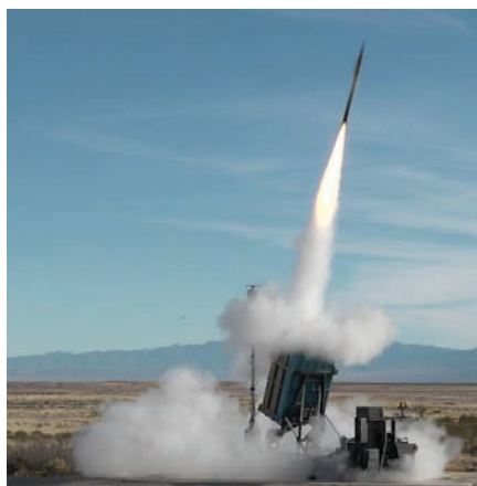
MRIC Launch.

The GBAD Program Office is organized into three Product Teams, each