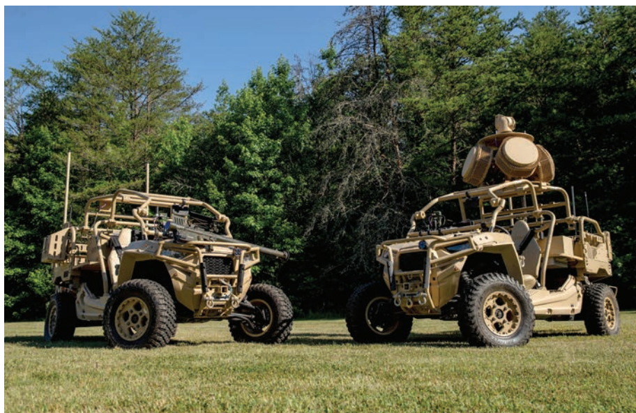
Light MADIS.

Until recently, precision fires were not related to small UAS (sUAS). As drone and sUAS technology proliferated, it has become apparent that C-UAS development is critical to “address the rapidly evolving challenge for U.S. forces at home and abroad.” 1