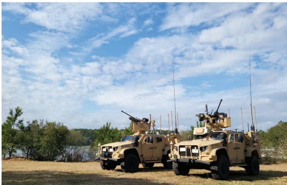
MADIS Inc 1.

Stinger missiles and possessing a turret-mounted M-240B or M2 machinegun. The Section Leader Vehicle manages the C2 system that links this capability to the Marine Air Command and Control System. These systems will incrementally “sunset” as their Rotary Wing/Fixed Wing defeat capability integrates into MADIS Inc 1.0 and begins fielding to the LAAD Marines.