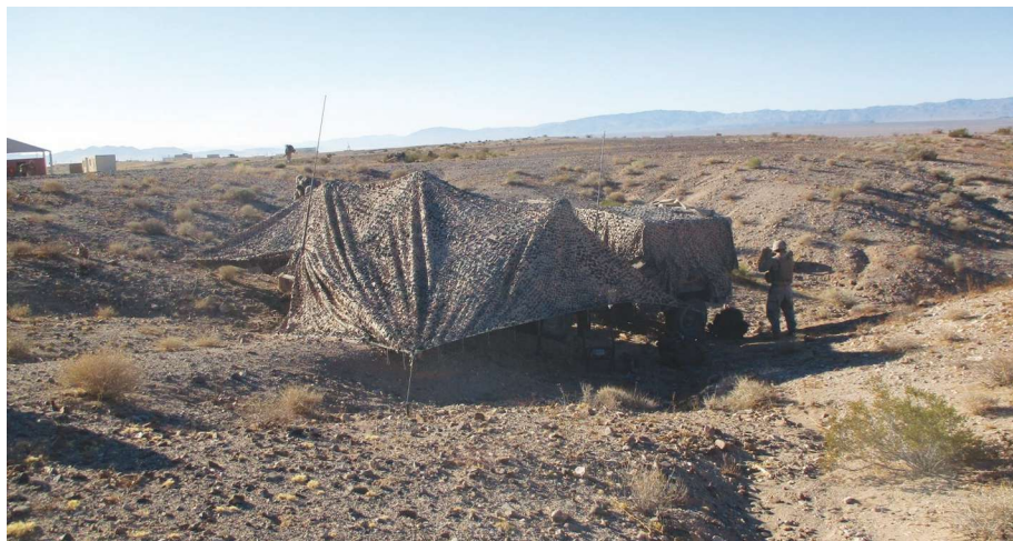
Figure 4. Proper terrain selection enhances effectiveness of camouflage (5-19). (Figure provided by author.)

in R220 very effectively hid their vehicles beneath camouflage netting and then compromised these well-hidden vehicles by milling around outside of their nets. (See Figures 9 and 10 on page 70.) Camouflage netting should be set up in a way that enables all essential functions to be conducted beneath it so that Marines do not need to go outside of it, and Marines must have the discipline to stay under it. (See Figure 11 on page 71.) Lastly, so as not to develop a culture of “hidiers” rather than fighters, Marines should be prepared to fight from camouflaged positions.