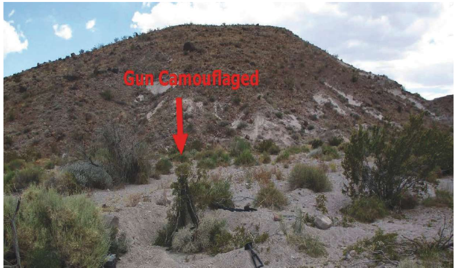
Figure 6. 81's A Section demonstrating good concealment by using effective terrain selection, camouflage techniques, and discipline staying underneath their nets (3-19).