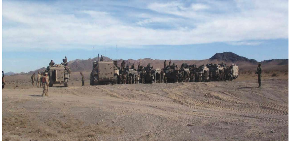
Figure 1. Poor dispersion in an administrative posture (5-19).

First and foremost, the most obvious lesson that stands out is survivability. Specifically, the vital importance of being undetected and therefore untargeted. The old adage, "what can be seen can be hit, and what can be hit can be killed," remains true today. In fact, with the proliferation of unmanned aerial vehicles, this adage rings even more true than before because there are now so many more "eyes" in the sky. With the increased numbers of intelligence, surveillance, and reconnaissance (ISR) assets available, supporting arms have shown themselves to be very effective. They are effective because the Marines in the forward areas are easy to locate. They are easy to locate because they