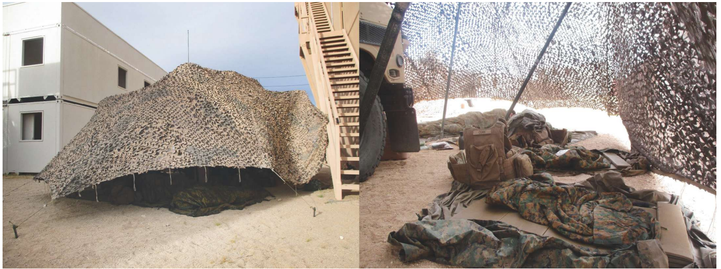
Figure 11. Essential functions must be maintained underneath camouflage netting (3-19).

answer to these many shortcomings is effective field craft. Field craft is a lost art, but because of FOF, our Marines are relearning it. Any observer of FOF will note the evolution that occurs from the beginning of an exercise to the end of it. By the end of the exercise, Marines are applying effective dispersion, use of terrain, camouflage techniques, use of battlefield debris, etc. They are learning. Unfortunately, they are learning the hard way and correcting themselves as the exercise progresses because they are losing lots of Marines. Why must units lose Marines before they remedy their faults? Why can they not conduct proper continuing actions from the outset?