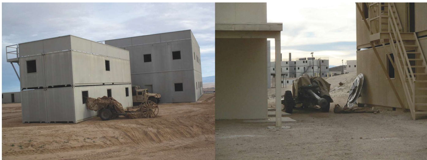
Figure 13. Effective concealment of British 105mm Howitzer (2-19).