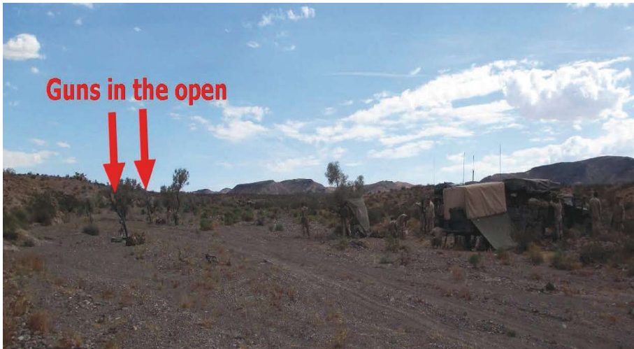
Figure 8. 81's B Section from same battalion demonstrating poor concealment by using ineffective terrain selection, a complete lack of camouflage, and Marines in the open (3-19).

on one side of the river and be silenced by a rocket from the other side. Eventually, both sides ran out of machine guns and rockets. At this point, the static combat was characterized as a battle between the riflemen of each side. As Figures 21 and 22 indicate (pages 75 and 76), U.S. Marines were often high and exposed, completely silhouetting themselves in windows while their opponent across the river was protected behind a wall of sandbags in his window and fired through a six-inch-wide aperture. The exercise ended shortly after these pictures were taken, but it is easy to infer which side would have taken higher losses had the exercise continued.