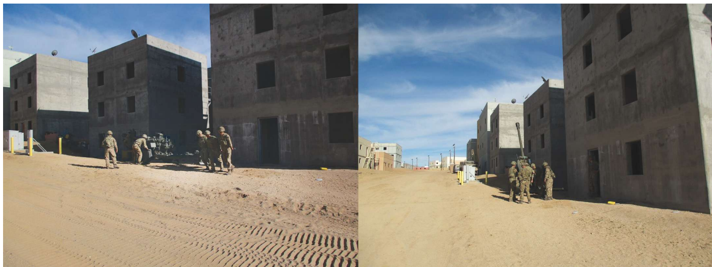
Figure 15. Effective hide-and-shoot tactics of British 105mm Howitzer (2-19).