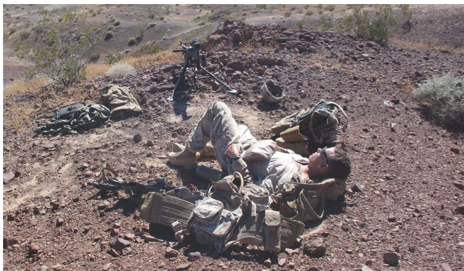
Figure 19. Inattentive leadership allows this Marine to be ineffective (5-19).

battalions in a pause in the exercise during 3-19. The combat that led to these losses was characterized by close quarters infantry actions that raged building to building across R220. These were not even the final figures at the end of the exercise. Figure 22 depicts the killed in action tabulated before a partial reset and return of “Cherry Pickers” to their units in 5-19. This slide only depicts Exfor figures due to the necessity to continually respawn Adfor “Cherry Pickers” per the scenario. The heavy losses in vehicles and personnel were mainly due to the effects of supporting arms, though significant “Cherry Pickers” from Battalion 2 were assessed in battles between dismounted Exfor infantry and Adfor