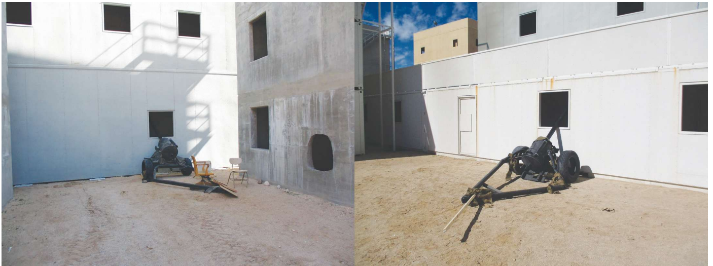
Figure 16. Effective dummy positions simulating British 105mm Howitzer (2-19). (Figure provided by author.)

ing contact with the enemy. In 5-19, there were seven rifle companies in the exercise (six Exfor and one Adfor), and those rifle companies of the opposing sides never fought one another. In fact, throughout the whole event, they never even encountered one another. This was because they never had to the opportunity to close on one another; they were consistently destroyed by enemy IDF and air assets long before they even got close to each other.