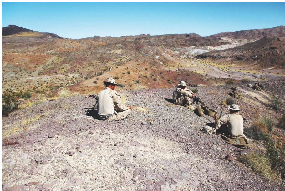
Figure 2. Using the topographic crest (5-19). (Figure provided by author.)