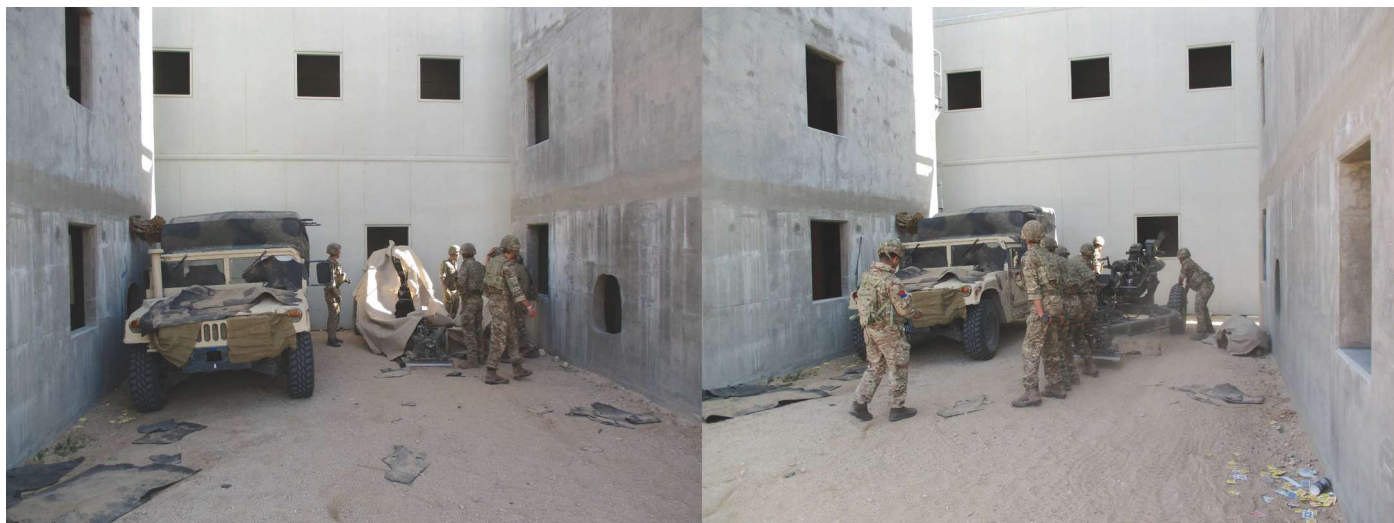
Figure 14. Effective hide-and-shoot tactics of British 105mm Howitzer (2-19).