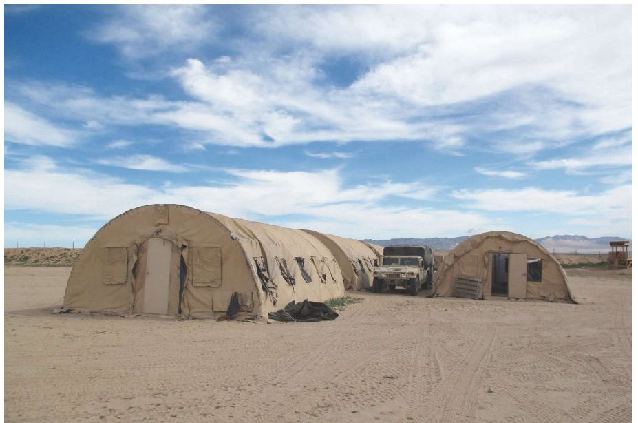
Figure 17. British 81mm Mortar Section (2-19).

“Cherry Picker” play. FOF has challenged units not only in how to treat these simulated casualties but how to deal with the large amounts of “Cherry Pickers” and how to continue to fight and accomplish the mission after taking such large numbers of them. Unlike the rest of ITX, FOF uses an attrition model for “Cherry Pickers.” When Marines are assessed as urgent “Cherry Pickers” or assessed as “dead,” they are out of action for the duration of the exercise and their rank does not matter as multiple platoon, company, and even battalion commanders have been “killed” in these exercises. This forces