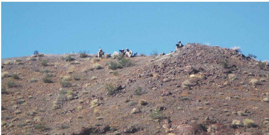
Figure 3. Same Marines as previous image skylining themselves (5-19).