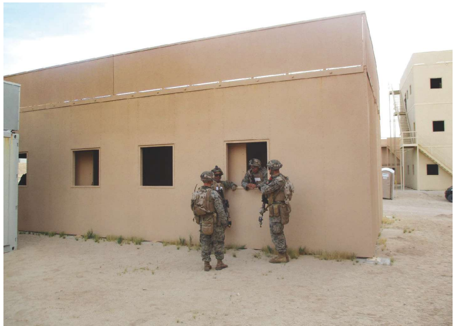
Figure 12. Marines are disclosing their positions to enemy ISR assets (3-19).

It is entirely possible for a unit to be completely destroyed before ever mak-