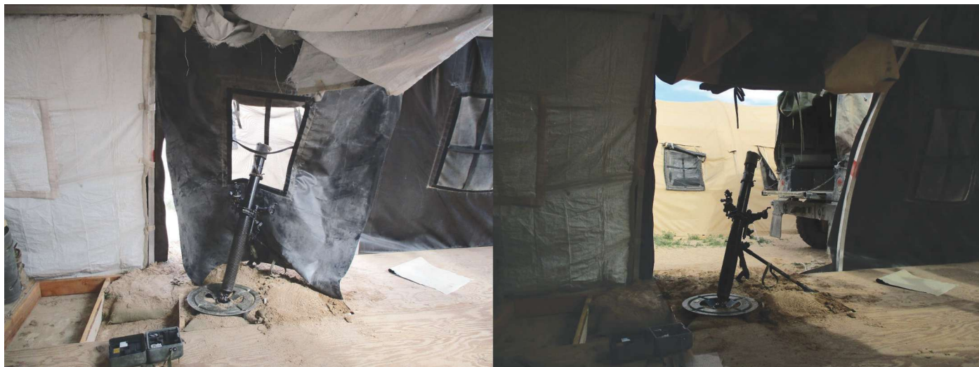
Figure 18. British 81mm Mortar fire capable from inside of tent (2-19).