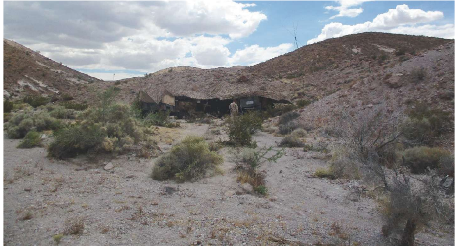
Figure 5. 81's A Section demonstrating good concealment by using effective terrain selection, camouflage techniques, and discipline staying underneath their nets (3-19).

Another instance where the Royal Marines demonstrated superior survivability techniques came during a stalemate between the two battalions. By the last day of the exercise, the Exfor battalion occupied the West side of the city and the Adfor battalion controlled the East side. The opposing forces were separated by a notional North-South running river that divides the city and combat was sporadic along the length of the river from one side to another. Essentially, a machine gun would open up