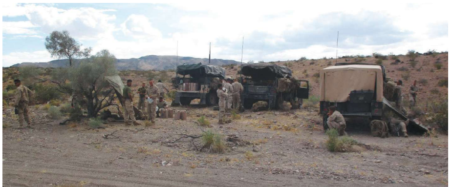
Figure 7. 81's B Section from same battalion demonstrating poor concealment by using ineffective terrain selection, a complete lack of camouflage, and Marines in the open (3-19).