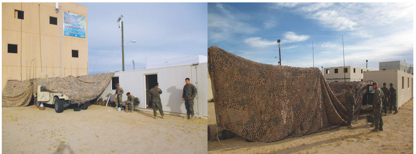
Figure 10. Use of camouflage netting ineffective with Marines outside of it (3-19).