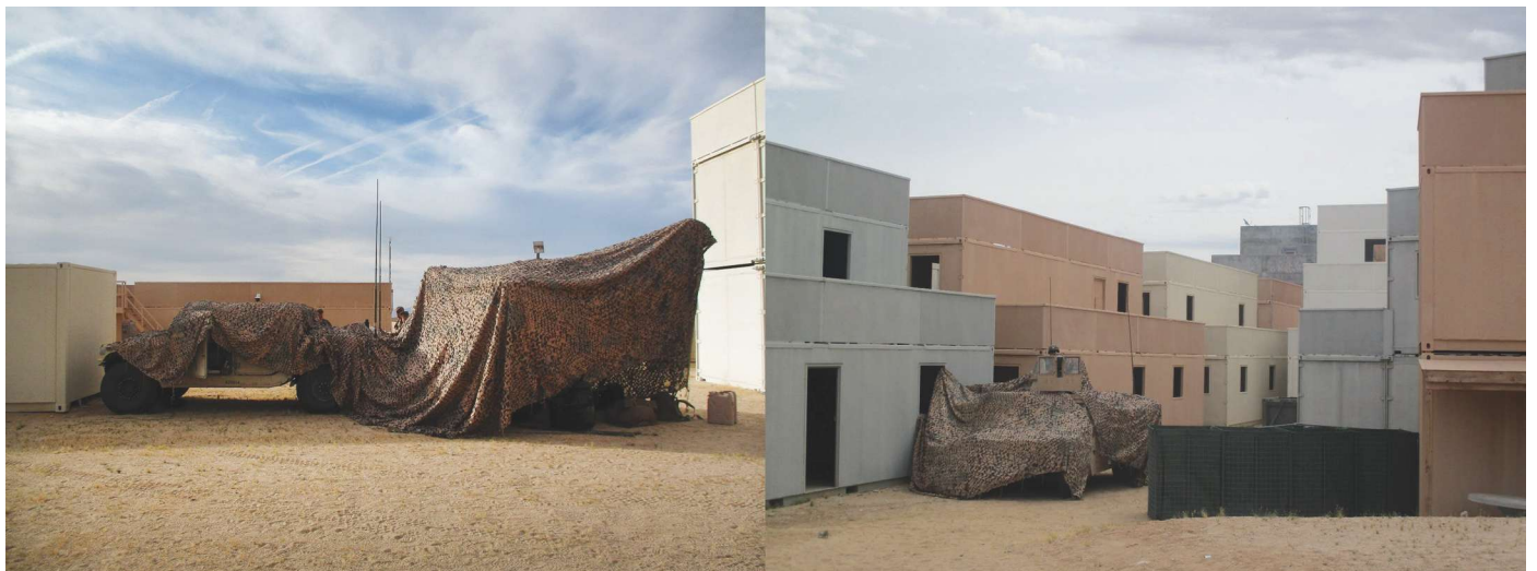
Figure 9. Effective use of camouflage netting (3-19).

As the British Royal Marines demonstrated on multiple occasions, the