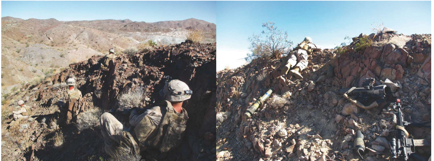
Figure 20. Vigilant small unit leadership makes these Marines more effective (5-19). (Figure provided by author.)