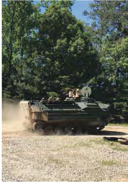
Members of FMS and foreign military taking a ride on the off-road course in an AAVP-7A1.

Included with our U.S. Africa Command/U.S. European Command team is the building partner capacity (BPC). BPC programs represent a broad set of authorities and missions that support improving the ability of partner