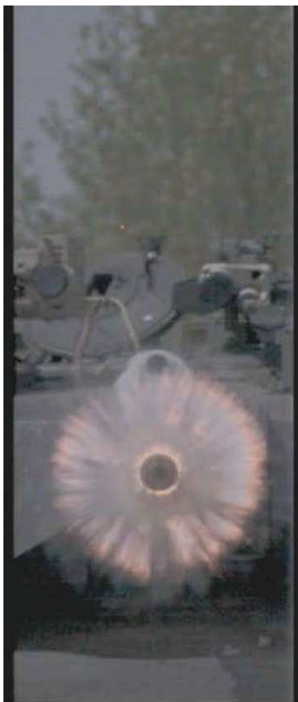
M1A1 firing the 120mm round.

As with any acquisition program, we are bound by laws and policies that dictate what we can and cannot procure for or sell to an international partner. The governing document for FMS is the Arms Export Control Act and the Financial Management Regulation, which dictates pricing and all financial authorities. In FMS, especially with BPC, new policy is published regularly by the Defense Security Cooperation Agency, the governing agency that provides financial and program management for FMS. As requirements change and processes are improved, policy changes are inevitable. Within the FMS division, the Policy and Support Team works diligently to stay abreast of all policy and law changes to maintain adherence