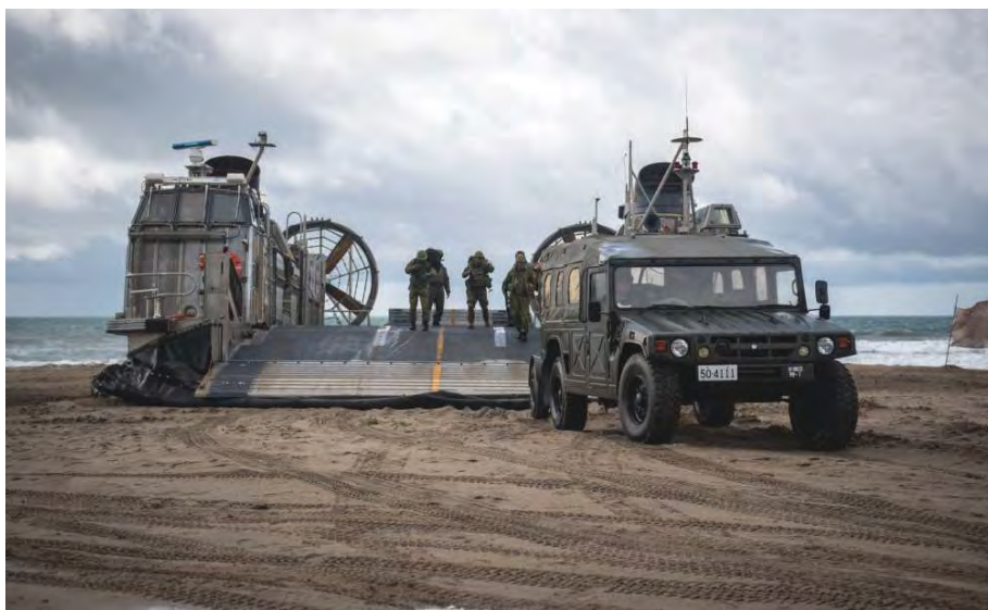
Exercise IRON FIST is conducted each year at Camp Pendleton, CA, and other areas of southern California.

Selling items from our inventory enables the possible reinvestment of funding back into the Marine Corps for new or upgraded equipment in addition to generating a cost savings or cost avoidance because of differed demilitarization or disposal cost. When the Marine Corps decided to upgrade the M16 to the M4, profits from the FMS sales of the M16s to trusted partners were reinvested into the program office for the procurement of the M4 for the Marines. Likewise, sales of five-ton trucks yielded proceeds for the Medium Tactical Vehicle Replacement program. To that end, Marine Corps FMS cases have generated over $135 million in return on investment. In the event that an in-kind replacement for the item being sold does not exist, the funding is forwarded to the U.S. Treasury and