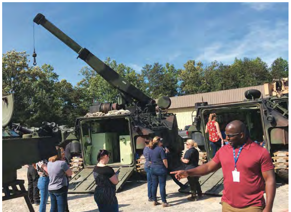
PME allows the IP team to stay abreast of the programs it manages.

A major advantage of BPC is that it provides developing nations with resources and material to become self-sustaining in various capabilities. The Marine Corps maintained a presence in the Republic of Georgia, helping the Georgians train and equip their military for operational readiness in theater. Because of the material and sustainment provided through multiple Coalition Readiness Support Program BPC efforts, the Georgian military readiness was realized, and the supporting Marine unit was able to return home. By equipping partners with goods and services through this process, the benefit to the Marine Corps is recognized by allowing our own resources to be reallocated to other priorities.