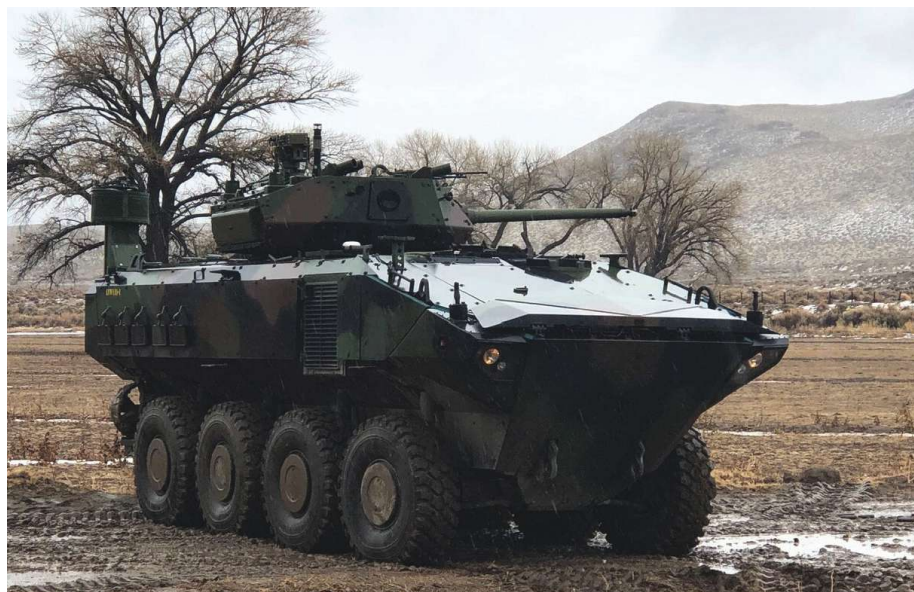
ACV-30 undergoing manufacturer testing incorporating the Kongsberg turret.

Undoubtedly, most Marines will have seen or heard of this platform as it fulfills a Service defining capability and it will replace an icon of the Marine Corps for almost half a century: the AAV. The ACV program is managed by the Program Manager Advanced Amphibious Assault and manufactured by British Aerospace Engineering Systems in concert with IVECO Defense. It is a modern, eight-wheel armored personnel carrier with ship-to-objective maneuver capability that can maneuver in high sea states, navigate through large surf swells, and rapidly maneuver on land—all with thirteen combat equipped Marines and two days of sustainment embarked. This vehicle offers maneuverability similar to the