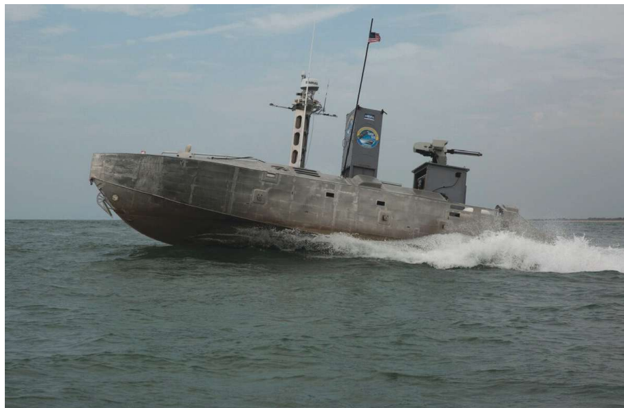
A USV supporting an exercise at Camp Lejeune, NC.

It is incumbent on a new generation of warfighters to refine and optimize these expanding capability sets through experimentation and operational exercise as they come to fruition. The lessons learned potentially provide for validation and refinement of the desired rudder shift in our warfighting approach. The future is here and now to embrace advancing technologies pertaining to autonomy, advanced manufacturing, digital communications and more while still being