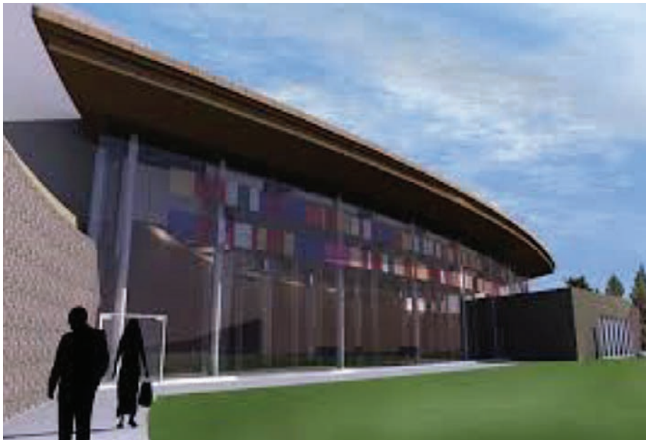
Above: A rendering of the Carolina Museum of the Marine | Al Gray Civic Institute. The museum will honor the legacy of Carolina Marines and Sailors and will highlight their accomplishments and innovations. (Photo courtesy of CJMW Architecture, Carolina Museum of the Marine | Al Gray Civic Institute)