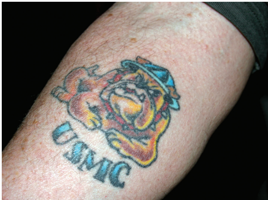
Is this expression of pride detrimental to the Marine's character?

Is it really a showstopper for a duly qualified Marine to be tattooed and then denied assignment to a certain billet just because he or she may display