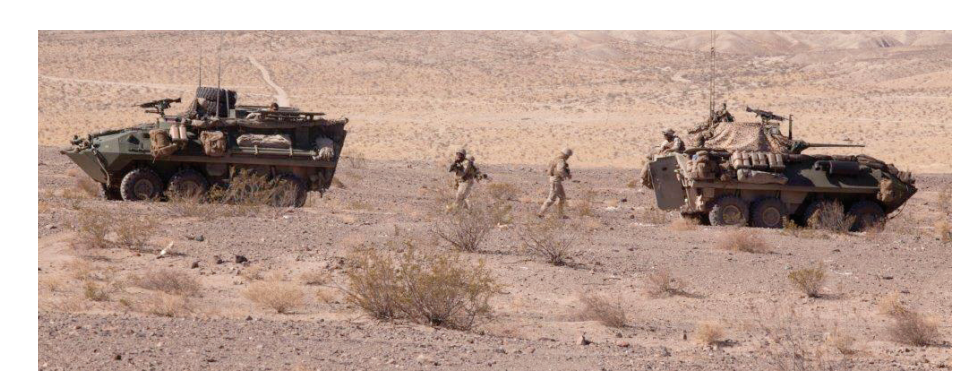
Marines conducted training before deployment and potential tasking as SPMAGTF-CR-Africa.