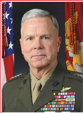
General James F. Amos

Thirty-fifth Commandant of the Marine Corps