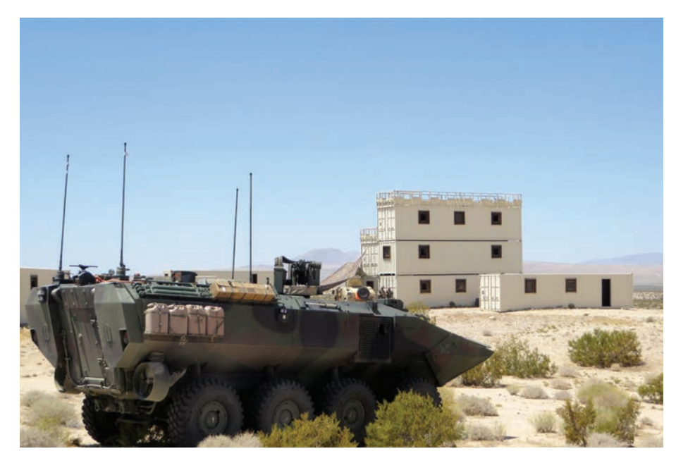
Amphibious Combat Vehicle engaged in a mission during operational testing at the Marine Corps Air Ground Combat Center, Twentynine Palms, CA.

MCOTEA's diverse group of civilian and Marine professionals combine MCPP with rigorous science to make an operational test. It takes Marines from the fleet with the right MOSs, the Marines at MCOTEA with operational