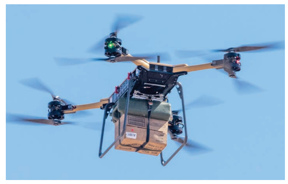
Future transformational resupply capability, Unmanned Logistics System-Air, undergoing operational testing by MCOTEA at Yuma Proving Grounds, Yuma, AZ.

When it came time for you to pull the system off-the-shelf and out of the armory, motor pool, or warehouse, it was ready because the system availability was evaluated to ensure that it could respond to a mission that could be called for at any time. The system did not break down during your mission because the prior operational test