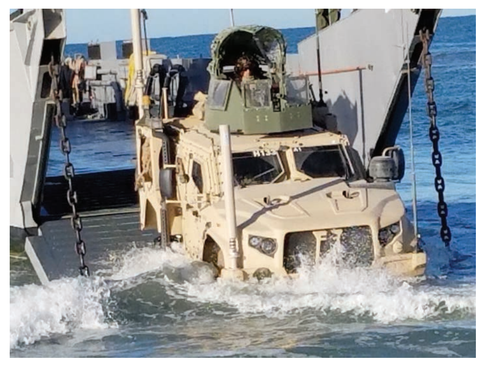
Joint Light Tactical Vehicle debarking from Landing Craft Utility boat to demonstrate transportability during operational test at Camp Pendleton, CA.

MCOTEA puts together an operational test for your system, or any Marine Corps system for that matter, by combining the Marine Corps Planning Process (MCPP) with the Scientific Method. MCPP is central to planning an operational test because the operational test is a military operation that requires military planning, but it must be done rigorously. The rigor is required to