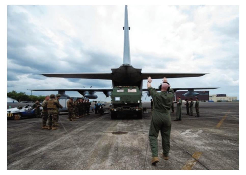
HIMARS/C-130 embarkation.

Over the past sixteen years, the Marine Corps has routinely operated at ranges in excess of 600 to 800 miles and beyond from the littorals. Concurrently, the decrease in available amphibious shipping has created gaps which have been partially mitigated by the creation of special purpose MAGTFs as well as split/disaggregated MEU formations. In doing so, logistical challenges and gaps in fire support capabilities have likewise emerged.