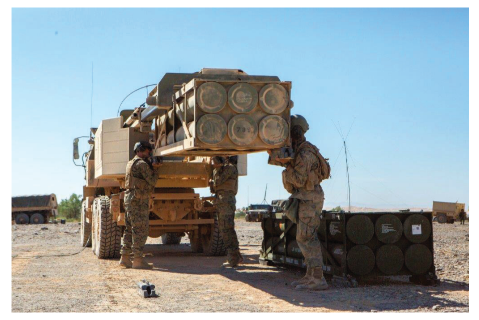
HIMARS platoons from 11th and 14th Marines have shown themselves capable of conducting raid and airlift operations.

gistical requirements of HIMARS fires in support of high-end conventional operations. HIMARS, when desired, can additionally provide a very visible signature and demonstration of commitment to allies and NATO partners.