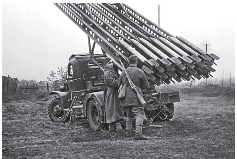
A Katyusha rocket launcher. (Ref for "BM 13 ref" chicomiranda.wordpress.com.)

Modern MLRSs can trace their origins back to the 1930s and 40s, during which the United States, Germany, and Russia developed basic, truck-mounted launchers designed for mobility and large volumes of fire. In 1983, at the height of the Cold War, the M270 MLRS made its debut with the U.S. Army. Built on an extended Bradley Fighting Vehicle chassis, the M270 series launcher was fielded in order to provide massed volumes of rapidly fired ballistic rockets on large troop