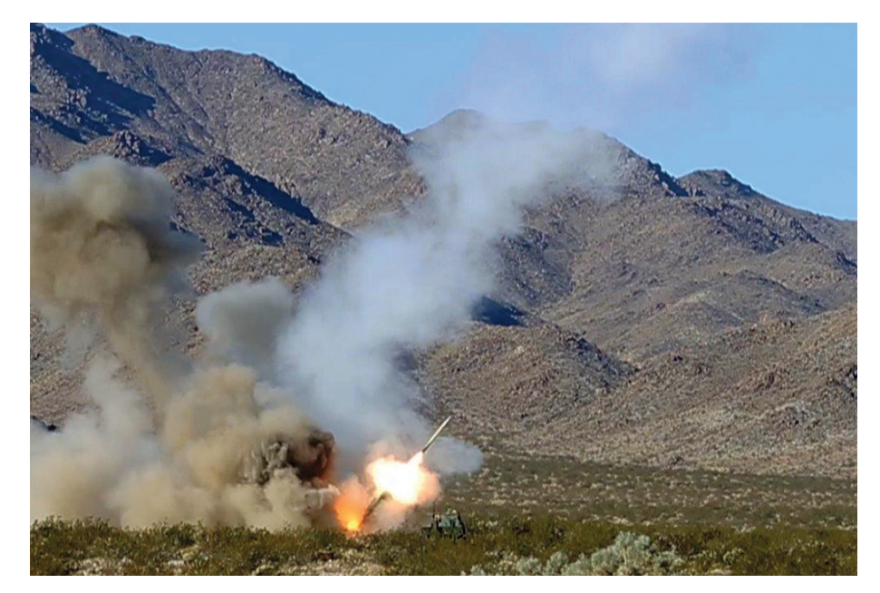
HIMARS firing during LSE-17, Twentynine Palms.

The multi-role F-35 represents a revolutionary leap in air dominance capability with enhanced lethality and survivability in hostile, anti-access airspace environments. The aircraft combines fifth-generation fighter aircraft characteristics—advanced stealth and integrated avionics—with a comprehen-