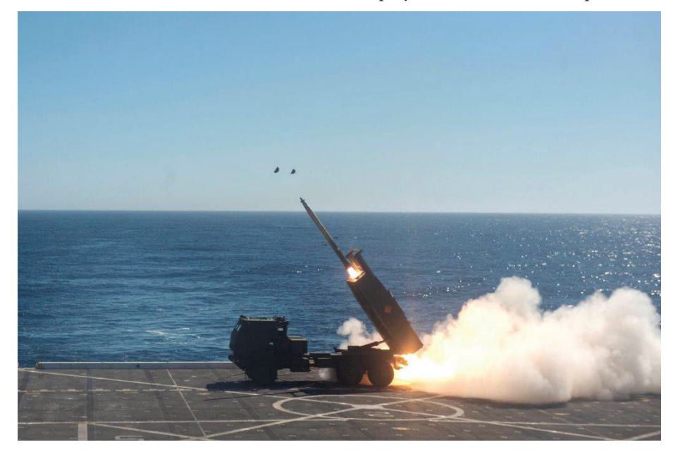
HIMARS firing from the flight deck of the USS Anchorage (LPD-23).

Recent maturation of HIMARS employment tactics, techniques, and