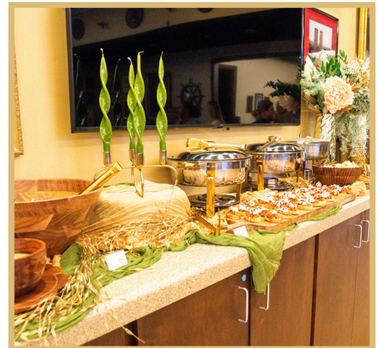
TABLE SPONSOR - $500